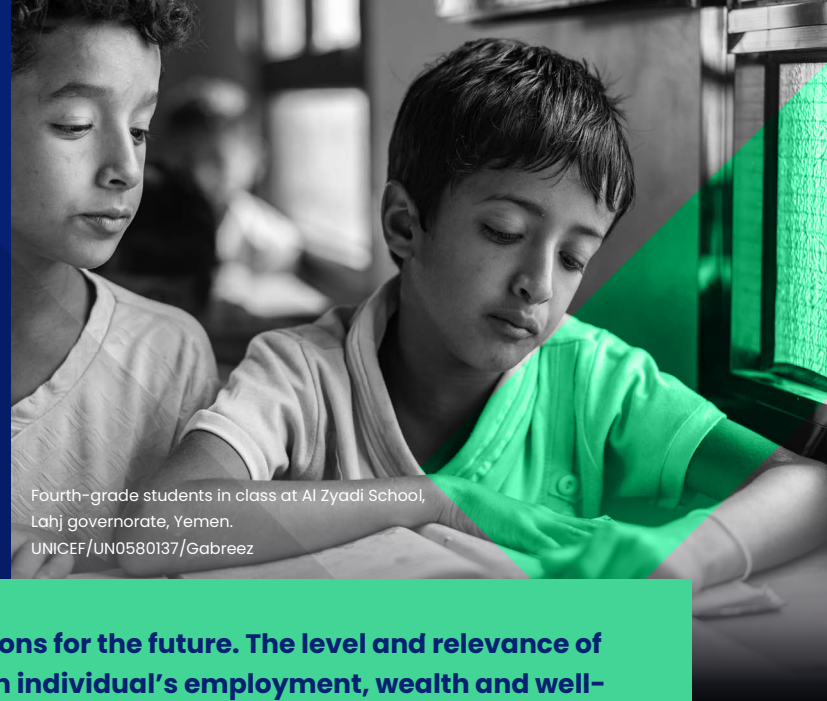
Fourth-grade students in class at Al Zyadi School, Lahj governorate, Yemen.

Quality education equips individuals and nations for the future. The level and relevance of learning and skills gained today will dictate an individual's employment, wealth and well-being tomorrow. The Global Partnership for Education (GPE) helps countries build stronger education systems as a springboard to stronger economies and more stable societies.